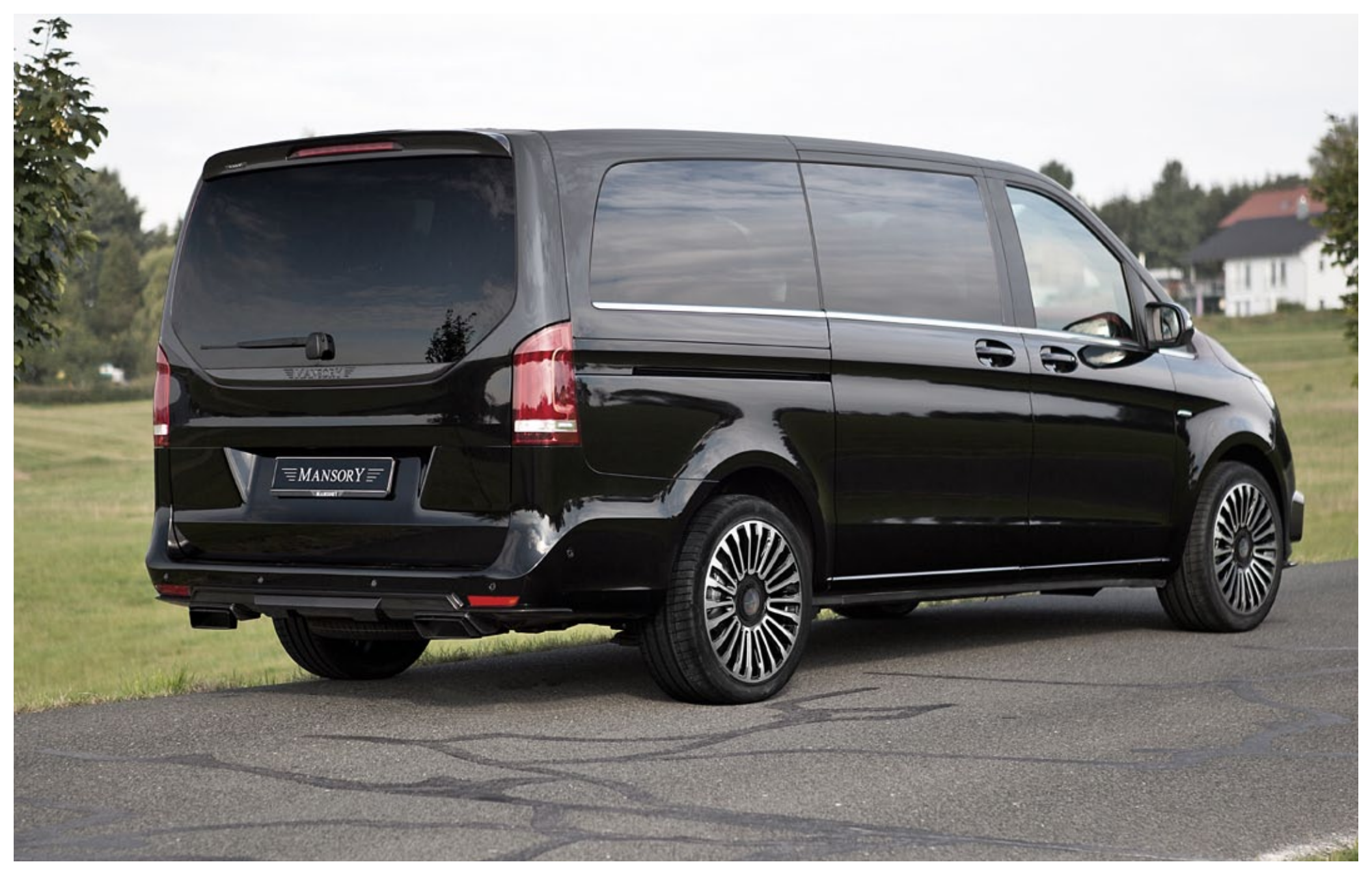
*matte coating on request - All listed carbon fibre parts are produced from standard MANSORY Carbon fibre fine (T200), or like the same carbon fibre as OEM standard parts. Prices and technical specifications are subject to change without prior notice, errors reserved.