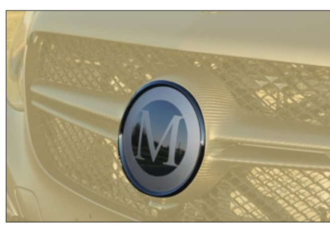
Front grill mask emblem with M