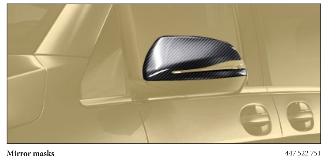
Mirror masks 2 parts set - left & right visible carbon fibre glossy*