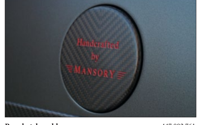
Rear hatch emblem visible carbon fibre glossy*