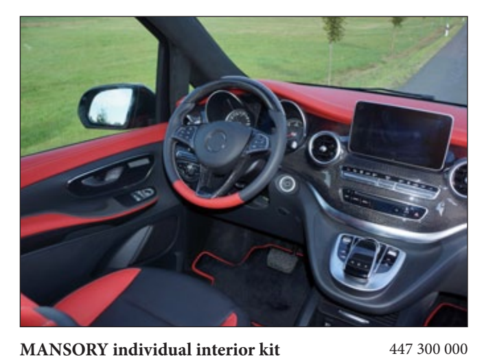
MANSORY individual interior kit

Complete refined interior, by exclusive leather sorts, combination on customers request.