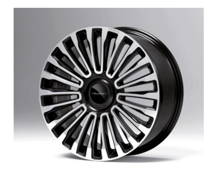
Multispoke 19 inch Diamond silver