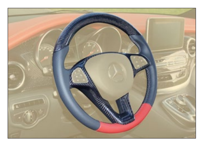
Sport steering wheel with logo MANSORY

Complete refined interior, by exclusive leather sorts, combination on customers request.