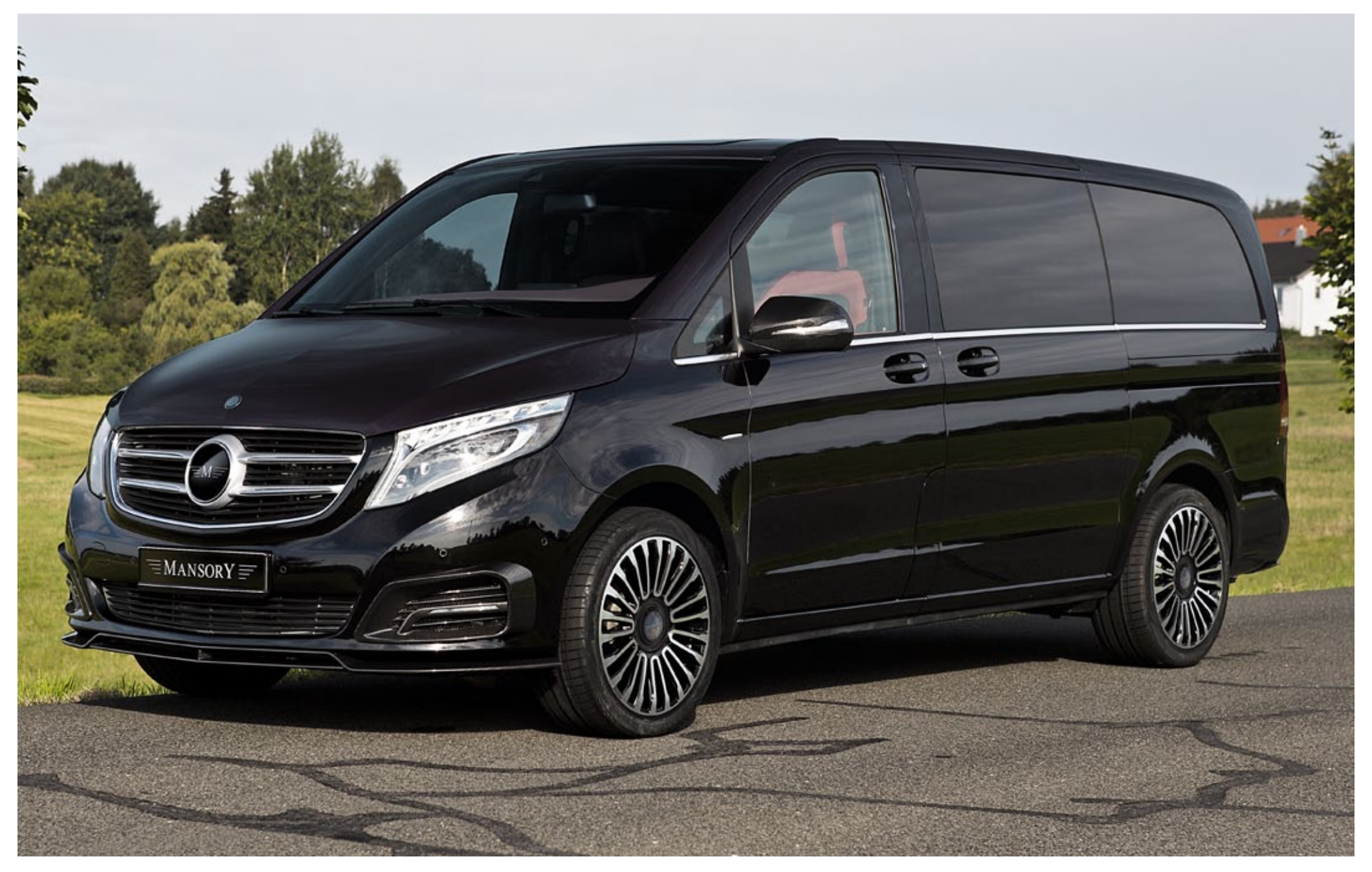
*matte coating on request - All listed carbon fibre parts are produced from standard MANSORY Carbon fibre fine (T200), or like the same carbon fibre as OEM standard parts. Prices and technical specifications are subject to change without prior notice, errors reserved.