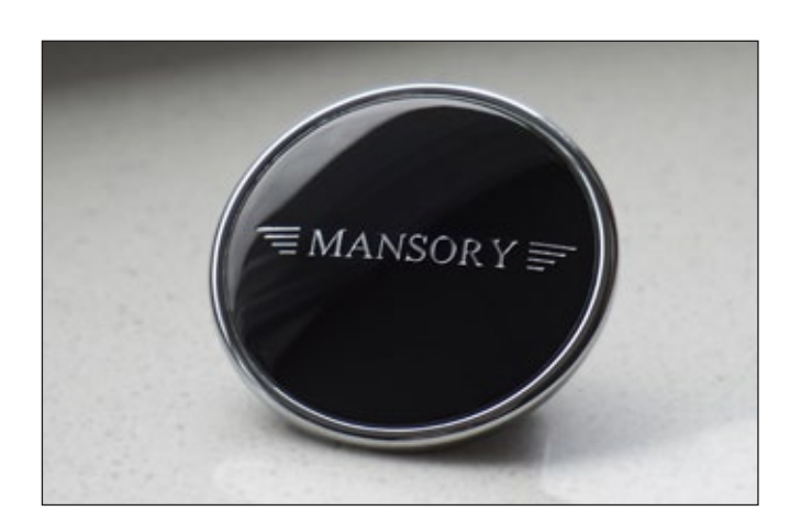
Logo emblem badge for Mercedes bonnet Replaces MB star for original engine bonnet